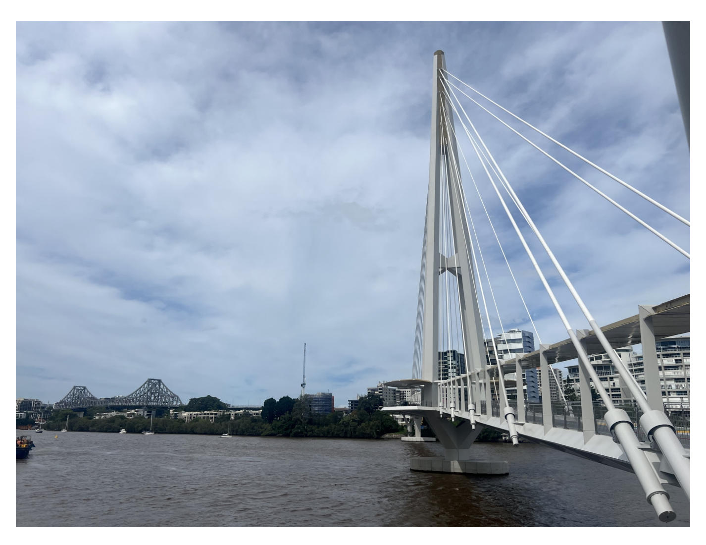
The Committee for Brisbane took a private tour of the new Kangaroo Point Bridge

On Sunday, December 15, Brisbane City Council will unveil the highly anticipated Kangaroo Point Bridge, a stunning new addition to the city's landscape. This state-of-the-art bridge will connect Brisbane's bustling city centre to the vibrant suburb of Kangaroo Point, enhancing both local and visitor experiences across the river.